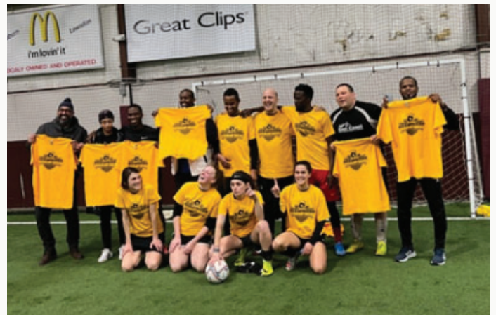
East Coast Home Improvements