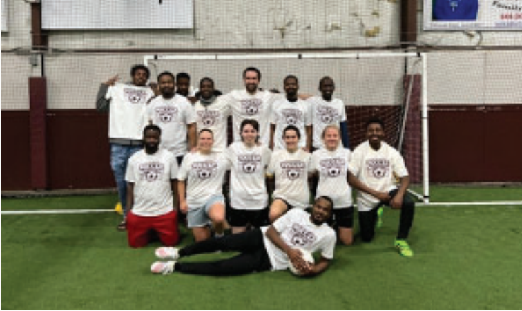
L Star FC